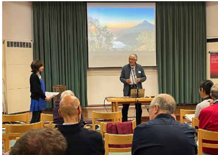
We heard from many participants, under the watchful eye of our session leaders!

Rather than inviting a visiting speaker from Japan, we asked the leaders of various ministries, churches and gospel works across the world to share with us their points for praise and prayer.