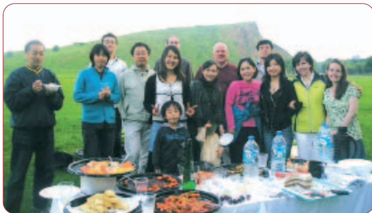
Outreach in Edinburgh

Japanese tend to be far more open to the gospel outside of Japan and away from pressures and duties at home. Please pray for outreach work throughout the UK by various groups and individuals including in Wimbledon, Belfast, Cambridge and Stockport, as well as in those places where JCL partners are working. Ask that British Christians and churches would be alive to the unique opportunities for Japanese to hear the gospel while they are in this country and would give them a warm welcome. Pray for several good new partnerships to be formed between JCL and British churches this year to reach Japanese. Please pray also for the thousands of Japanese in countries like the US, Australia and New Zealand where they also have more opportunity to meet Christians, and ask that many of them would go home as Christians.