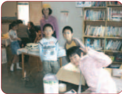
Children at the church Fun Day